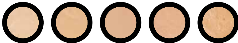
Naturelle I C1010NB1