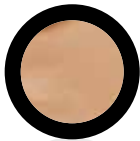
Orange HiLite C2010OH1