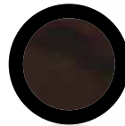
Naturelle LoLite II C2010NC2