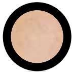
Pink HiLite C2010PH1

DMK Correction Colors are the first to use professional concept color correction and to apply it to higher quality cosmetics. Rather than simply 'cover up' skin discolorations – the typical approach of 'over-the-counter' products – our correction colors work to neutralize all types of blemishes by manipulating how light reflects off the surface of the skin. Clients need less makeup for perfect results!