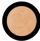
Blue Neutralizer II C2010BN2