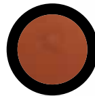
Dark HiLite C2010DH1