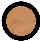
Blue Neutralizer I C2010BN1