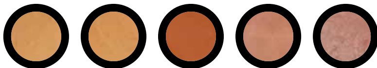
Ebony I C1010EB1