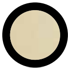
Red Neutralizer II C2010RN2