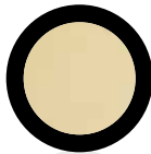
Yellow HiLite C2010YH1