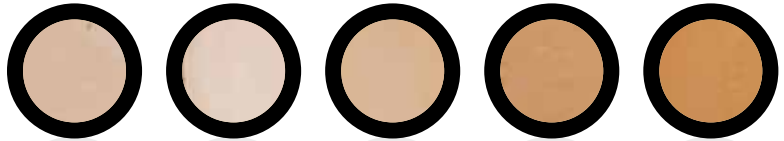
International I C1010IN1