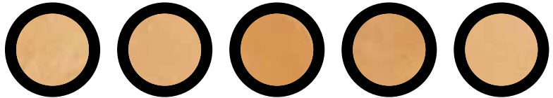
Shinto I C1010SH1