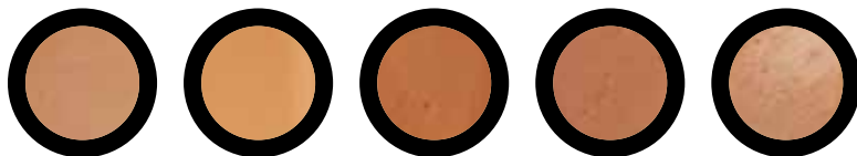
Olive Beige I C1010OB1