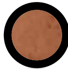
Naturelle LoLite I C2010NC1