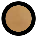
Red Neutralizer I C2010RN1